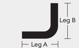
Equal Leg Angles